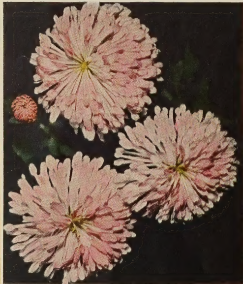
LOVELINESS SPOON. 60c each; 3 for $1.50

7 Sterling Spoons Truly the very best in spoon varieties 7 Sure-to-Bloom Plants $3.50 (1 of each pictured)